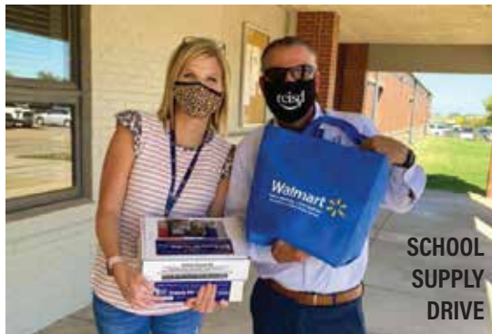
SCHOOL SUPPLY DRIVE

Our dedicated directors are volunteers who work tirelessly to support the education provided across Roysce City ISD. The board, comprised of parents, community members and local business owners, meets monthly to discuss finances and the fundraising efforts of the organization. The group is divided into teams like finance, membership recruitment and public relations.