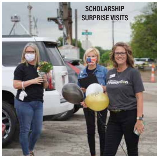
SCHOLARSHIP SURPRISE VISITS