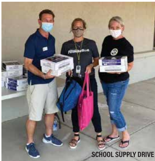
SCHOOL SUPPLY DRIVE