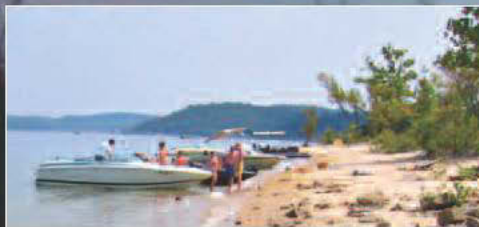
Warm enough to swim in by mid May!