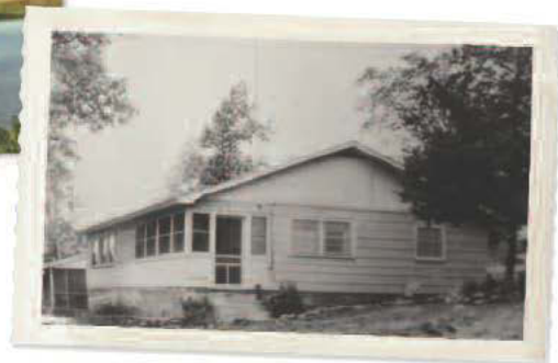
The Lake House late 1950s