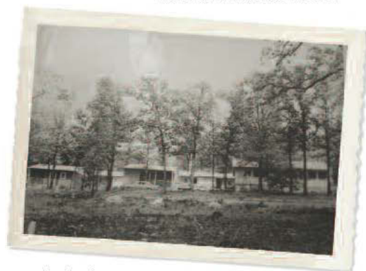
Mockingbird Resort as it appeared in the 1960s