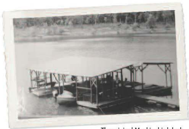
The original Mockingbird dock

"A good vacation is measured not by how long it lasts, but by how long it is remembered."