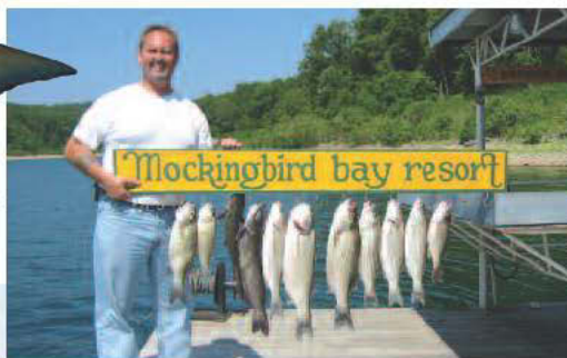
See y'all at the fish fry!