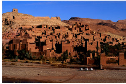
Ouarzazate, Morocco, featured in "Game of Thrones."

Adriatic, has several sites that were a perfect fit for GoT. Situated on the Dalmatian Coast, the late-medieval walled city of Old Town is ripe with Gothic, Renaissance and Baroque churches, monasteries, palaces and fountains. Feature on GoT – Pile Gate, a medieval planned development of the 15th century, and the 11th-century Lovrijenac Fortress, located on a cliff.