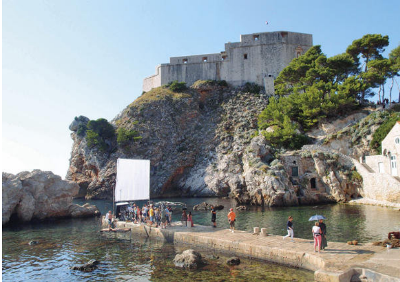
Dubrovnik, Croatia, also known as King's Landing.

Where do Westeros and Essos fall on the map exactly? They don't. These are the mythical lands where the HBO series "Game of Thrones" takes place. Still, the locations where the show films -- Iceland , Morocco and Croatia -- are some very real destinations for travelers hoping to capture the spirit of the epic fantasy.