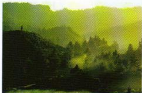
Maori mystique Dawn at Treetops Lodge & Estate unveils a misty New Zealand forest that shelters a host of wildlife.