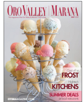
Oro Valley | Marana Magazine