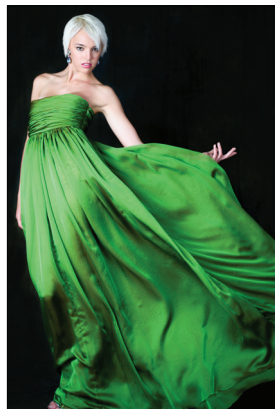
AJ Couture House