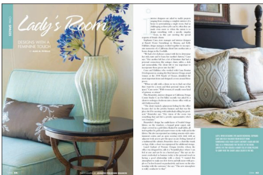
Studio C Interiors