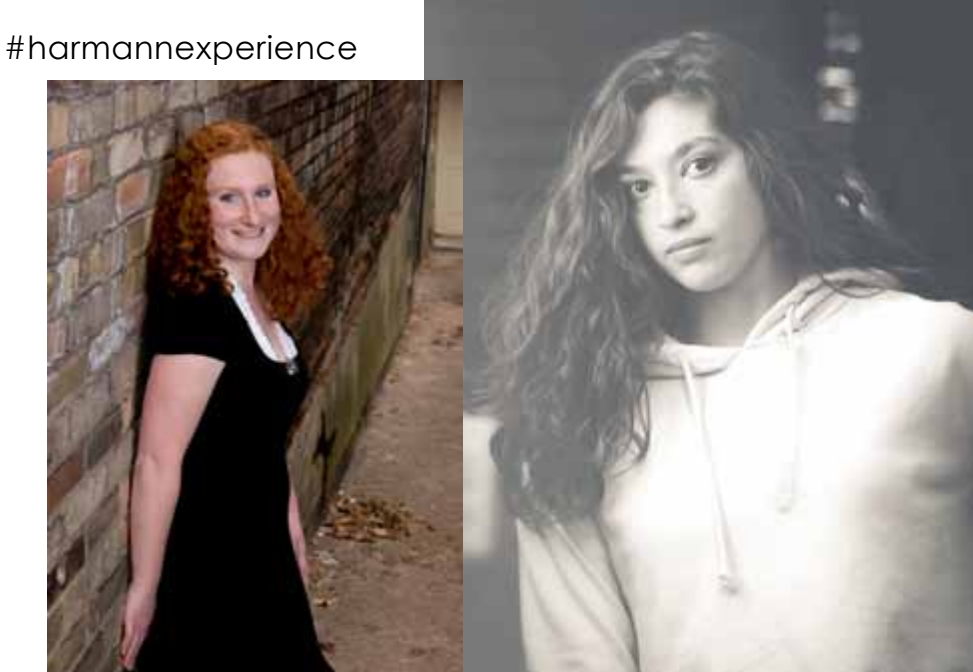
The FUTURE belongs to those who BELIEVE in the beauty of their DREAMS ."